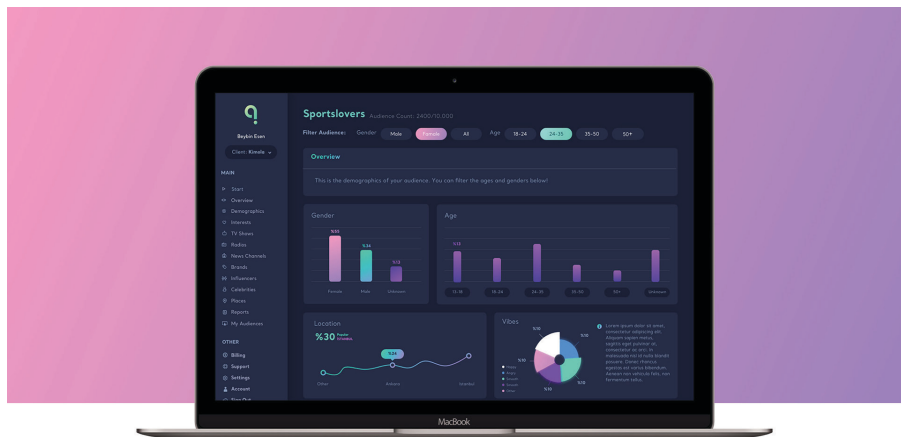
Furkan Şahin, Kimola Product Design, 2018